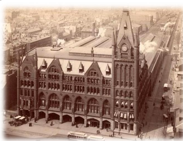
LATROBE RAILROAD STATION , Latrobe, Pennsylvania (pictured above) Remodeled to Restaurant Usage