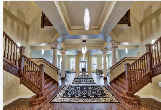
Highland Hall, Hollidaysburg, PA

DEAL BUILDING (V.A. CLINIC), Cumberland, Maryland Complete Mechanical & Electrical renovation for conversion to V.A. Clinic