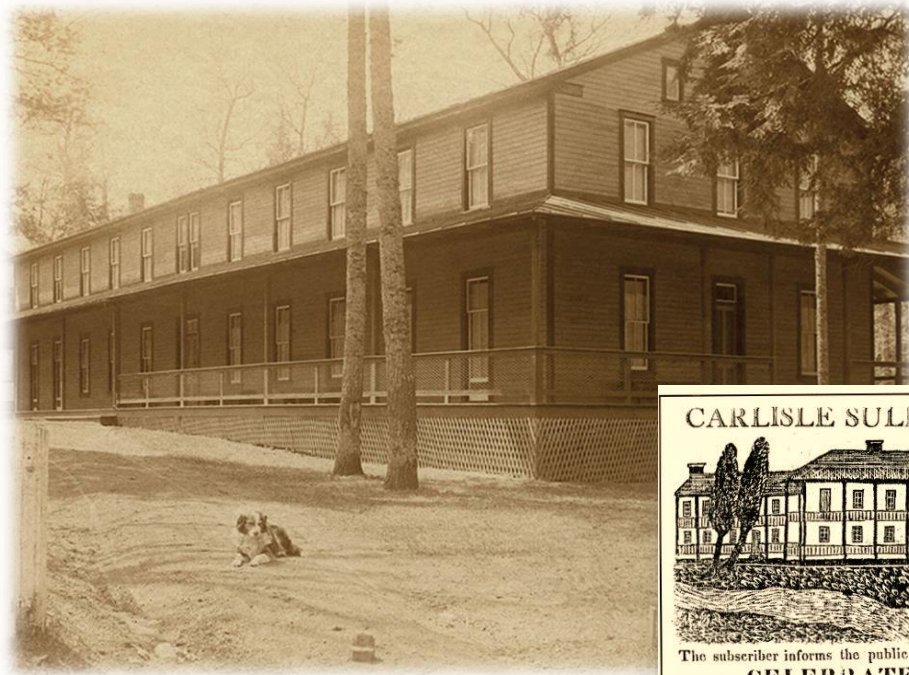
Pictured above: White Sulphur Springs, "Harrison House;" original two-story hotel, pictured with the Colvin family dog. Circa 1890

541 Main Street, Windber, PA 15963 (814) 467.6877 www.easthillseng.com