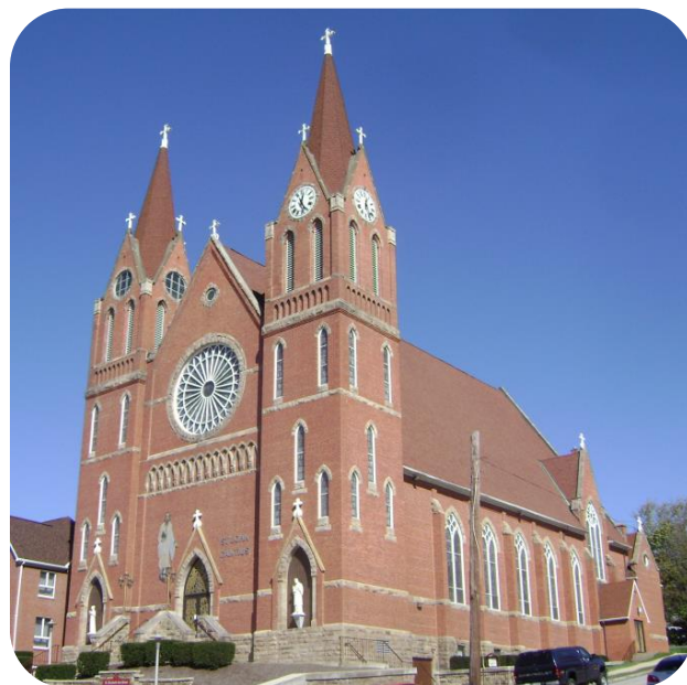
St. Elizabeth Ann Seton, Windber, PA

WESTMONT CHURCH OF THE BRETHREN – Johnstown – Renovations