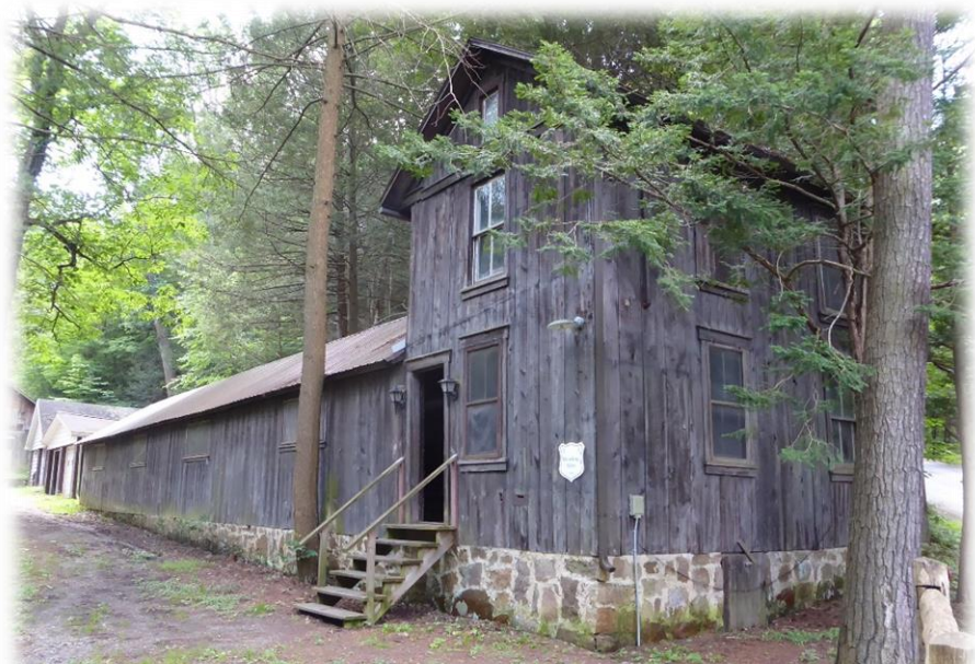
WHITE SULFUR SPRINGS EASTERN CONFERENCE CENTER , Manns Choice, PA Provided full MEP Design Services to furnish facilities Conditions Assessment & Schematic design Services