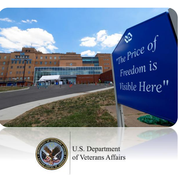
Clarksburg VA Hospital - Clarksburg, VA

CLARKSBURG VA HOSPITAL – Clarksburg, WV – Morgue Relocation